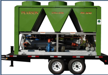
Portable PH-3240 Can be pulled to job site with pick up truck

We have over 25 years of application experience and technical know-how. Customers can count on us before, during and after the sale. We analyze your concrete usage for proper unit sizing, help with chiller location, piping, programming, system operation, maintenance and troubleshooting.