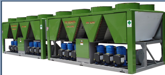
(2x) PH-4340 High Capacity