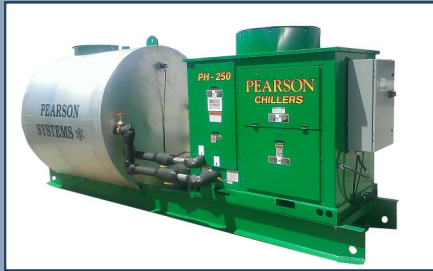
PH-250 skid mount with P-1 1,000 gallon insulated tank