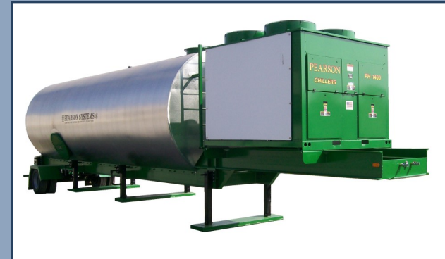
Portable PH-1440 Chiller P-10, Chiller & 10,000 Gallon Insulated Storage Tank